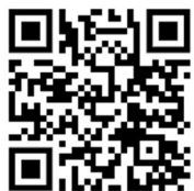
Fellowship Form QR Code