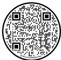
Ways to Give QR Code