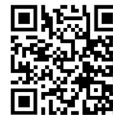
Ways to Give QR Code