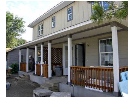
The Loaves and Fishes Townhome - nearly completed in August 2009!

Thank you for your continued support of our Missions projects with Habitat for Humanity and the Loaves and Fishes Coalition!