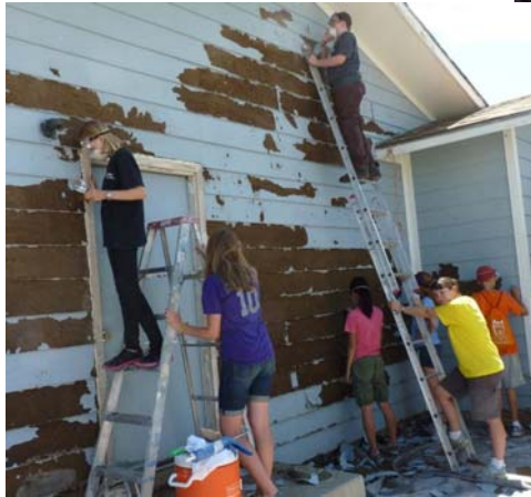
Youth Painting a Home